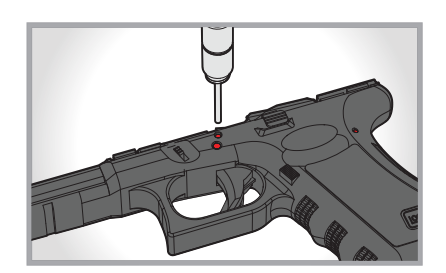
Easily remove pins to disassemble your Glock to clean, modify or maintain