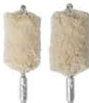
20 GA. / 12 GA. MOPS