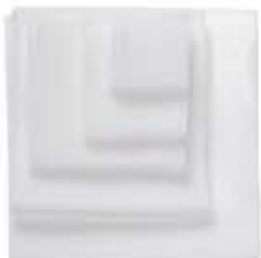
50 CLEANING PATCHES