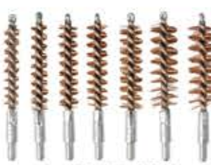
.22 - .45 CALIBER SPECIFIC PHOSPHOR BRONZE BORE BRUSHES