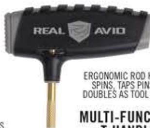
ERGONOMIC ROD HANDLE: SPINS, TAPS PINS AND DOUBLES AS TOOL HANDLE MULTI-FUNCTION T-HANDLE