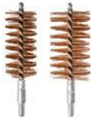
20 GA. & 12 GA. PHOSPHOR BRONZE BORE BRUSHES