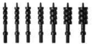
.22 - .45 CALIBER SPECIFIC BORE PATCH JAGS