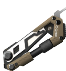
BOLT OVERRIDE & SCOPE TURRET ADJUSTER