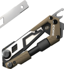
CORD CUTTER & BOTTLE OPENER