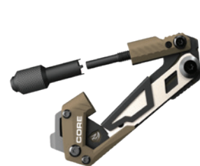
TAKEDOWN PUNCH & A2 FRONT SIGHT ADJUSTER